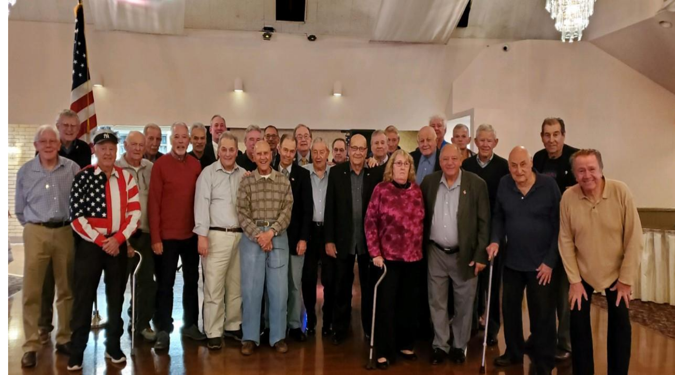
Veterans Appreciation Reception held at Memorare on Nov. 20th