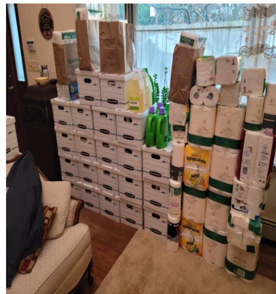
Food collected at Shop Rite Food Drive, on Nov. 5 th , for donation to St. Rose of Lima and St. William's Outreach.